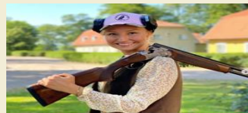
Ebba Busch, Minister Ind. & environment