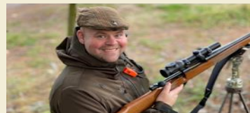
Peter Kullgren, Minister agriculture