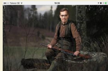
Ulf Kristersson, Prime Minister